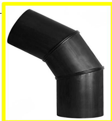
SEGMENTOVÉ KOLENO 60°